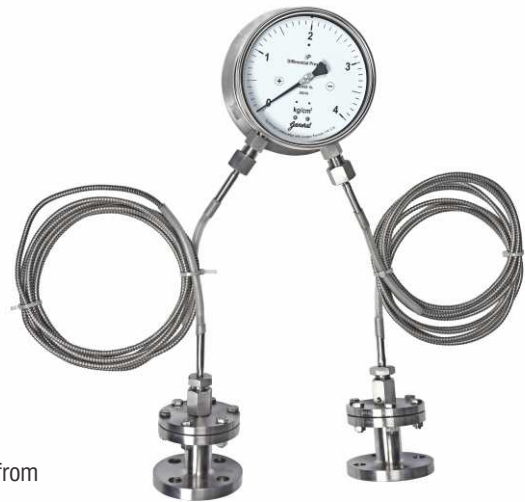
DP Gauge with Diaphragm Seal & Capillary

The parameters mentioned here are the standard specifications / values generally used for most of the process applications. Any other specification not appearing here also can be provided as per customer requirement. For higher temperature services above 100°C, we recommend to provide sufficient Impulse Tubing to bring down the fluid temperature .